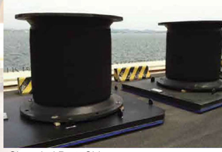
Shanghai Port, China