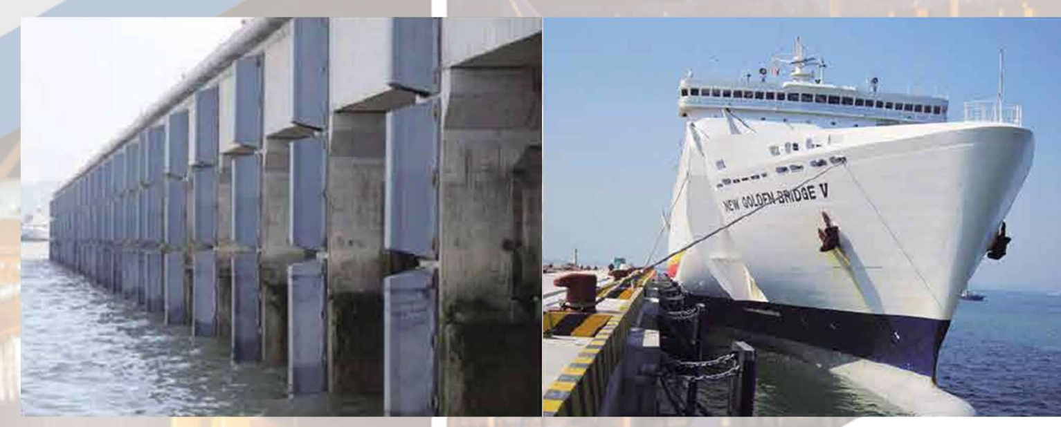
Naval base, China

Apart from their standard range of products, Liaoning Qingyuan's fenders and bollards are highly customisable and able to be tailored to individual requirements.