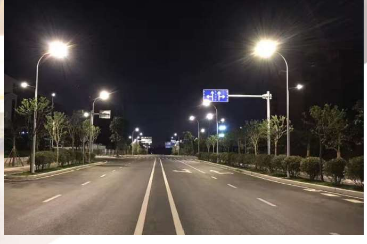
Lighting for roads in Fujian, China