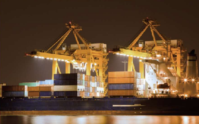
Lighting for ship to shore cranes in Guangzhou, China