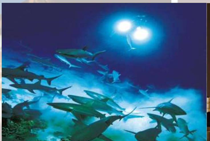
Lighting for deep sea exploration

With over 30 patents for lighting products, various International and Chinese certifications, places Zhongke Xinyuan as the only technological leader in lighting technology and products. With lighting products spanning across civil and industrial uses, the clients' base spans across government and civil authorities, port authorities both in China and abroad and anywhere and anyone that requires lighting solutions.