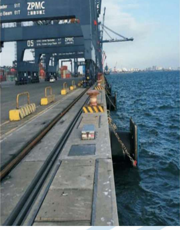
Port of Hong Kong, China